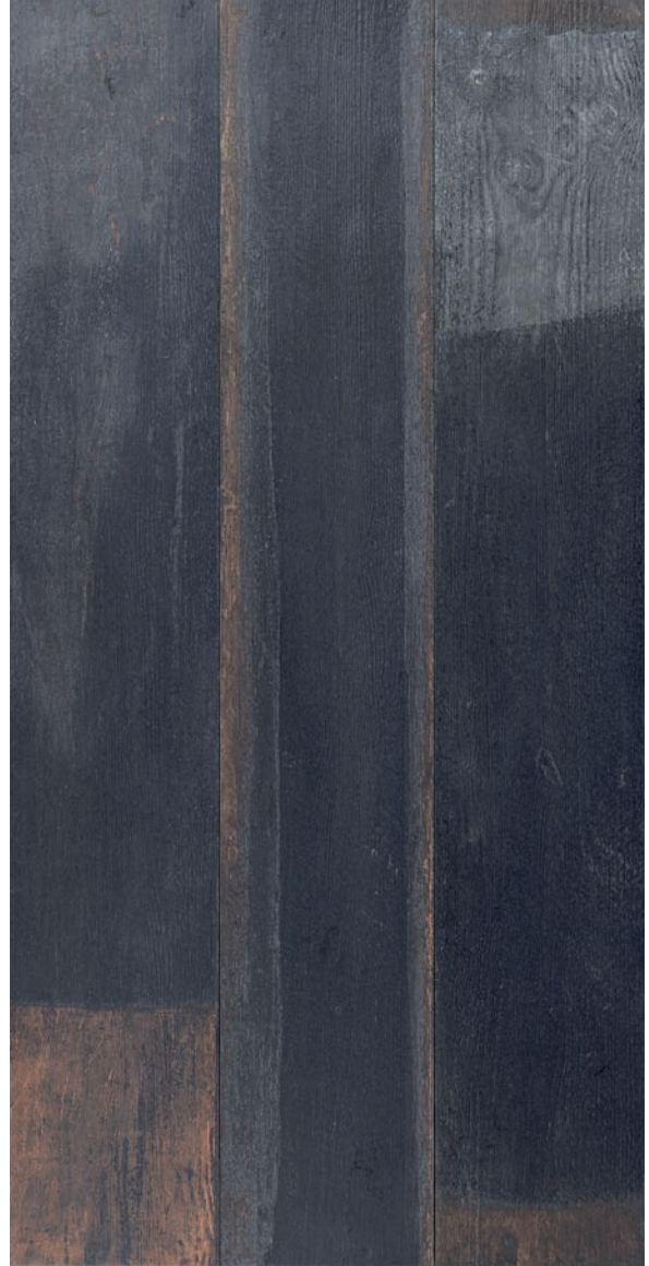
20 x 120 cm (8 x 48) OE.SP.BND.0848

All items shown in this document are part of Olympia's stocking program. For special orders, please contact your Olympia Tile Sales Representative.