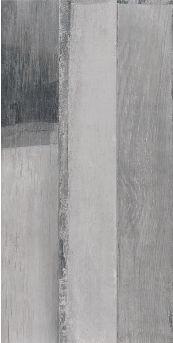
20 x 120 cm (8 x 48) OE.SP.SMK.0848