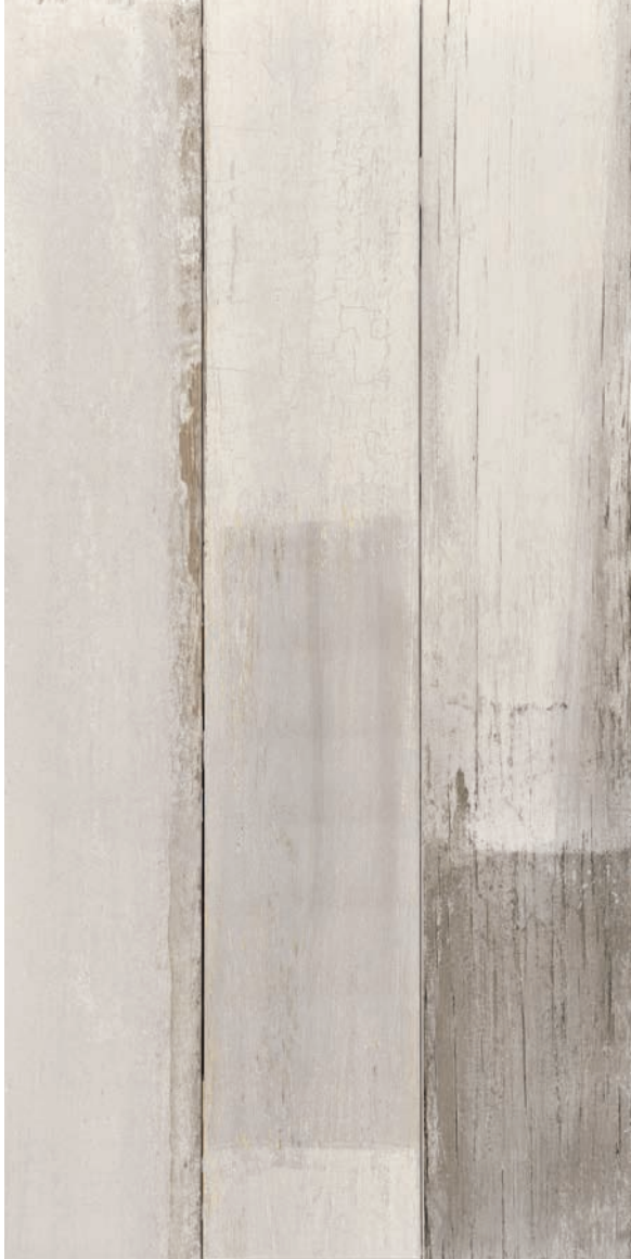
20 x 120 cm (8 x 48) OE.SP.GLR.0848