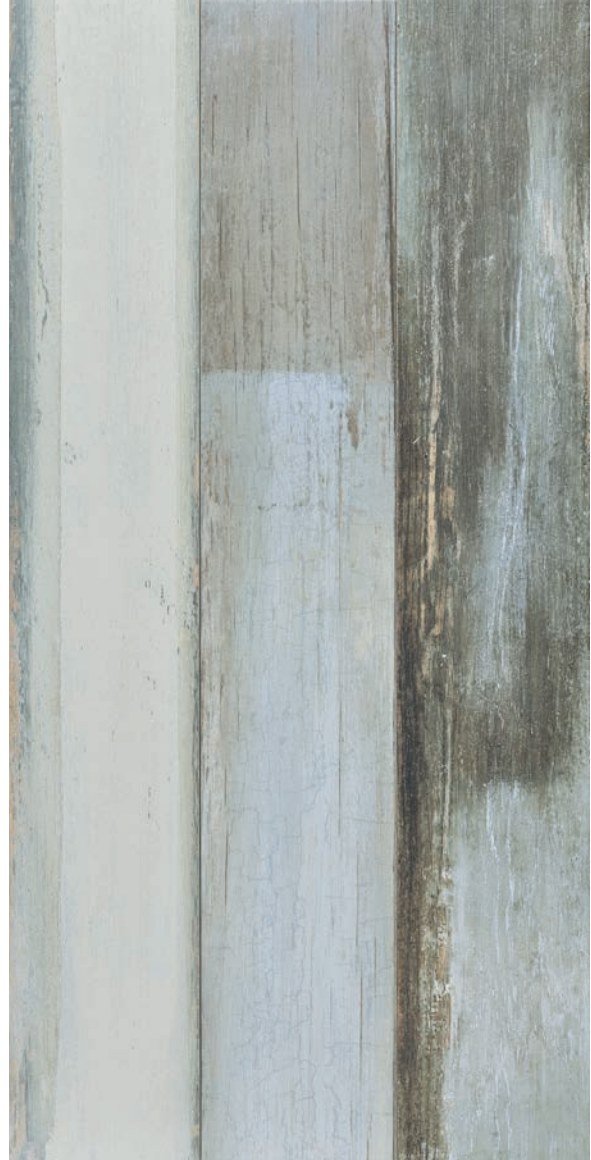
20 x 120 cm (8 x 48) OE.SP.LAG.0848

All items shown in this document are part of Olympia's stocking program. For special orders, please contact your Olympia Tile Sales Representative.